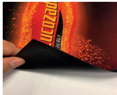
Anti slip backing