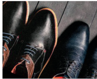
Photographic HD print quality