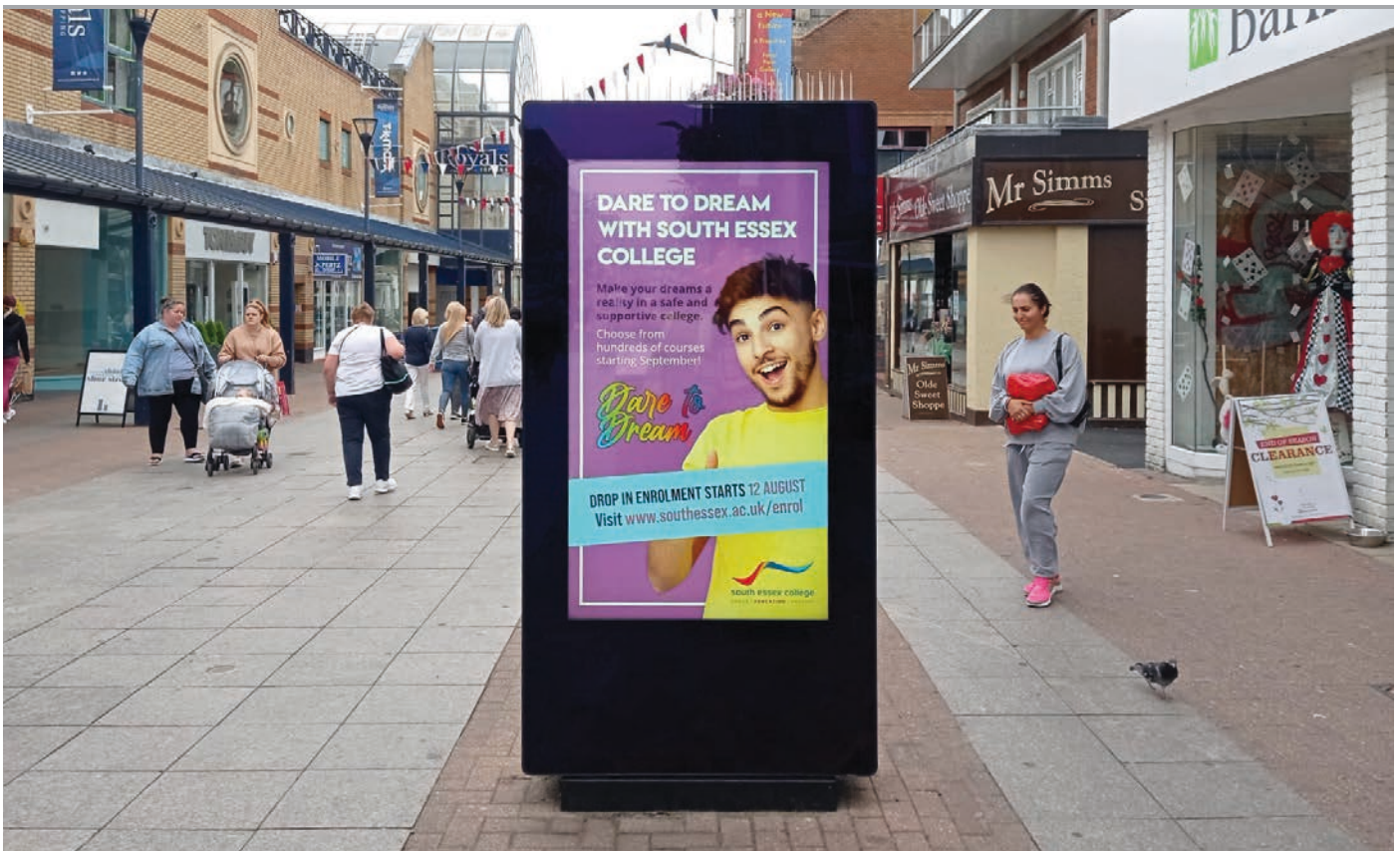
Stunning outdoor totems; perfect for any weather conditions